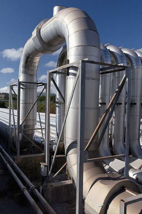
geothermal heat pump