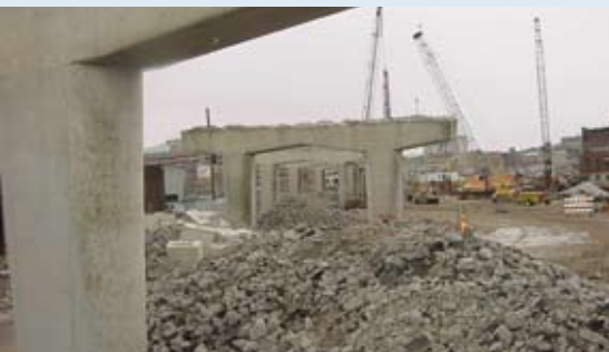
Milwaukee's Park East neighborhood after two freeway ramps came down in 2004.

In Milwaukee, residents of the Park East neighborhood worked with the city to make sure that when two downtown freeway ramps were demolished, the land would go to a high-density, mixed-use development including affordable housing and mass transit. The Community Benefits Agreement the residents signed with the city also included a commitment to green building and good labor standards both for construction workers and for those who will ultimately work in the development's commercial buildings. The Park East CBA, including legislative language, can be found at www.wisconsinsfuture.org/workingfamilies/econdev/index.htm . For more information on community benefits agreements generally, see www.communitybenefits.org .