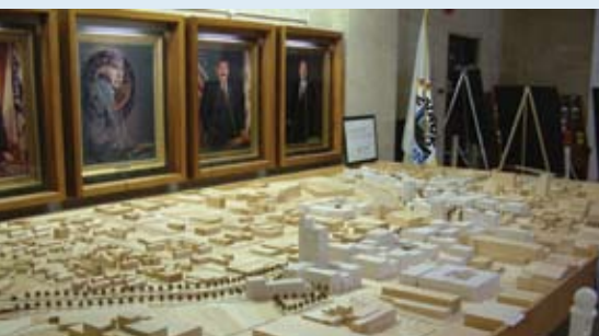
New development plan for Park East, put together by neighborhood residents and city planners, including affordable housing, transit, green building principles and high-wage job guarantees.